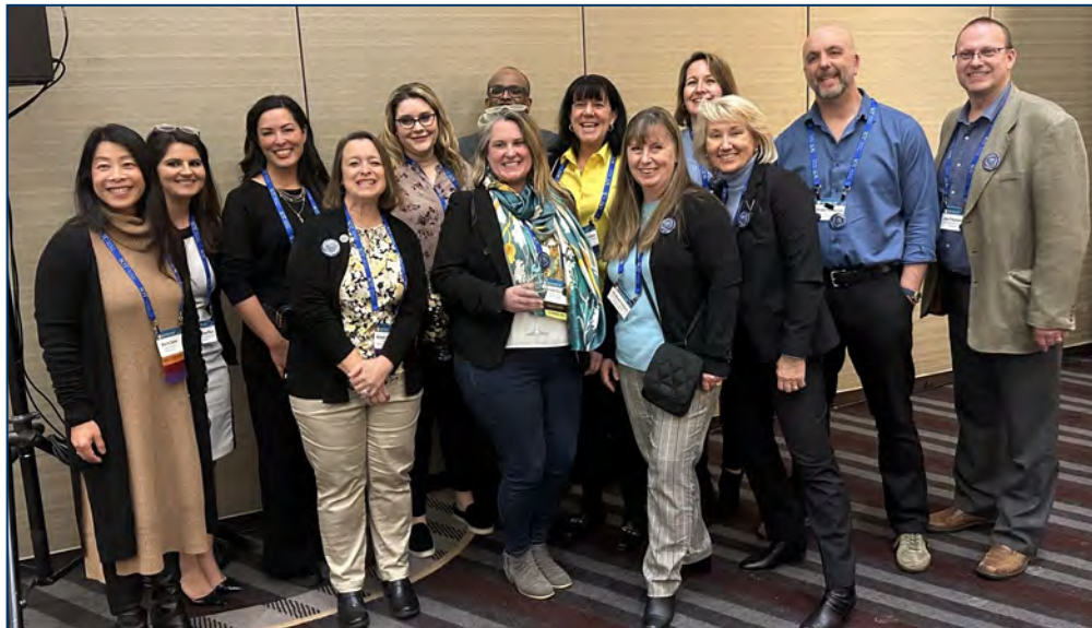
BELOW: CURRENT AND NEWLY ELECTED ABT BOARD MEMBERS