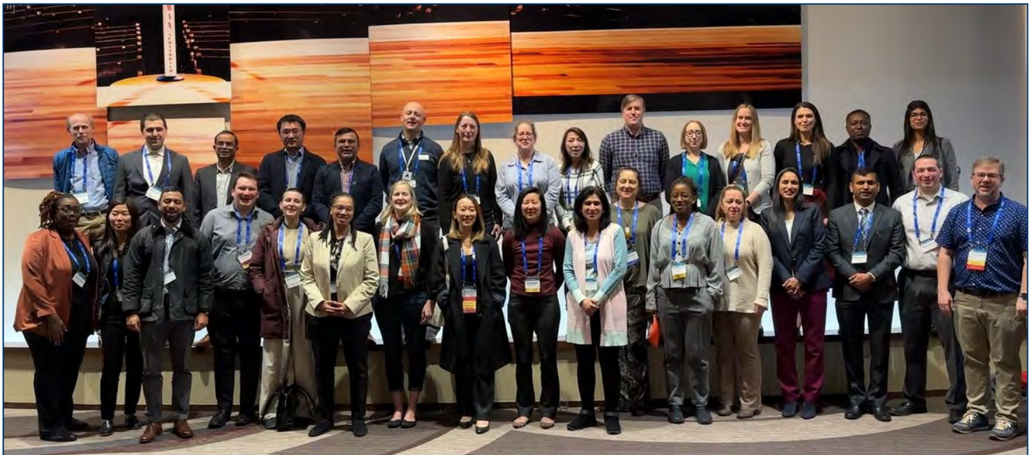
ABOVE: NEW DIPLOMATE PHOTO